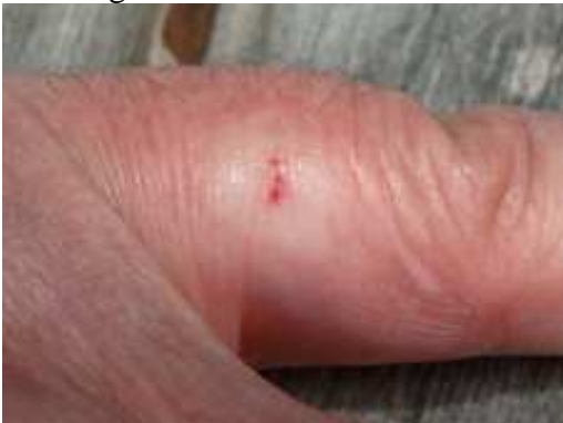
6 minutes later, after the sting has been removed