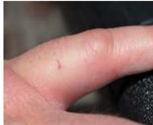
27 minutes later