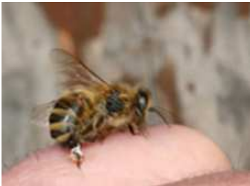
The stinger is torn off and left in the skin

(Fotos and comment from Wikipedia, the free encyclopaedia, October 2009)