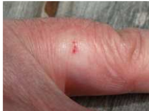
2 minutes later