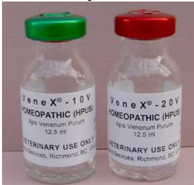
BV homeopathic solution