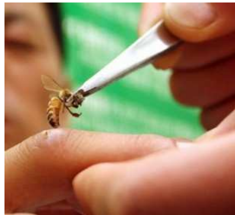
Application of whole bee stings