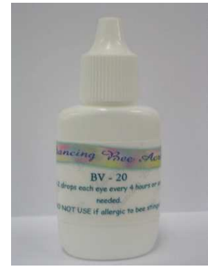
BV eye drops